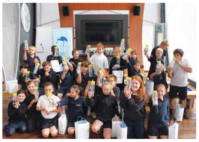
Students from Commercial Road Primary School at the launch of the partnership between Latrobe Community Health Service and Gippsland Water.

We also recently completed a workforce planning process to map what our workforce needs will be in the future, and put in place a strategy to meet that need.