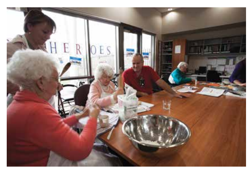
Planned activity groups, pictured here at our Morwell site, help combat social isolation among older community members.

We are pleased to report Latrobe Community Health Service is already demonstrating these qualities. In the past year we launched 'Your Care Choice', a fee-for-service offering to provide direct care services within the home to the aged, people with a disability, and their carers.